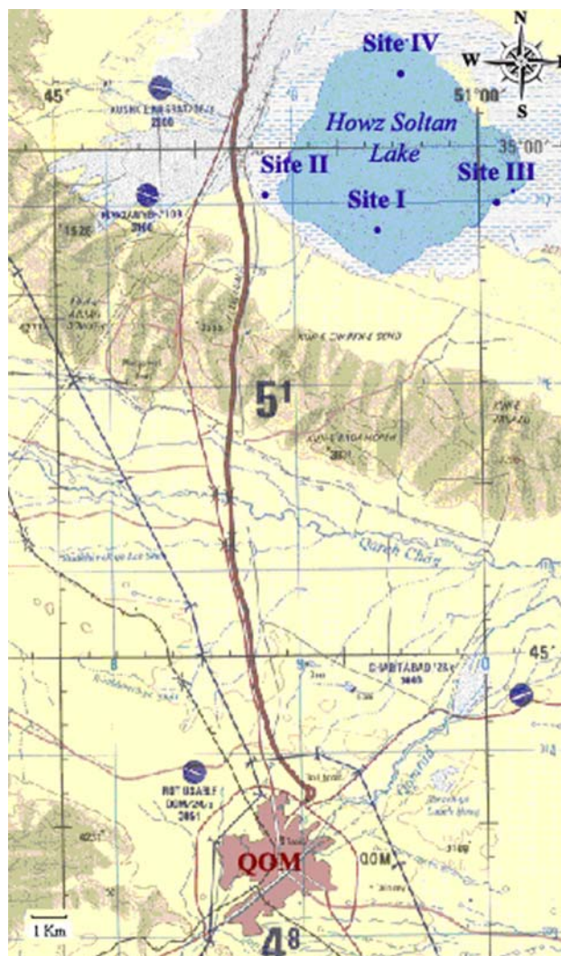
Fig. 1 Map of Howz Soltan Lake showing the sites (I, II, III, IV) used for sampling in this study

The temperature on the sampling sites varied between 11 and 17°C in wet seasons and 28–34°C in dry seasons. The pH of samples was 6.5–8.2. Samples were collected in